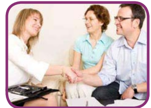
Active vs. passive investing