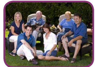
Who needs a will? (revised rules from 2009)