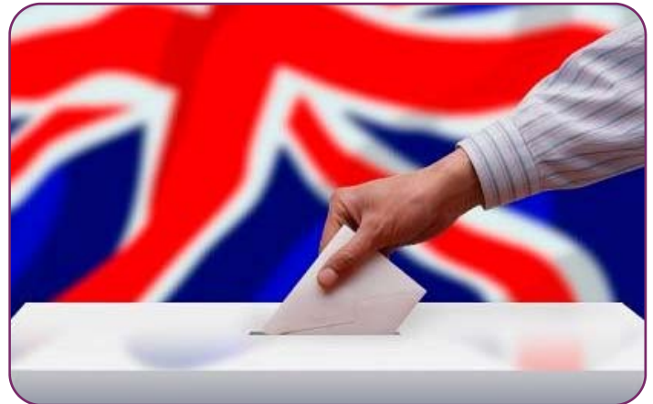
After the election comes the pain of paying for so much borrowing

All investors are affected by the economy and it is therefore revealing that the Chancellor says that the previous government's "golden rule" about borrowing over the economic cycle will be missed by a massive £485bn in the current one. He has, not surprisingly perhaps, abandoned this unreliable measure for the future, preferring instead to rely on the new independent Office for Budget