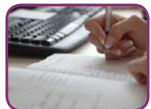
Self-certification to end