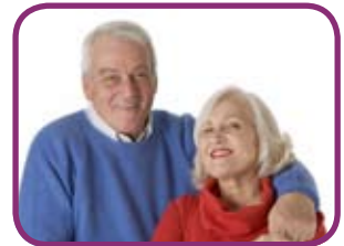
Later retirement looms